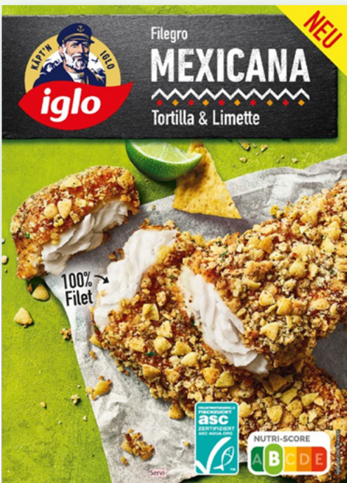
Exciting New Coating Technology