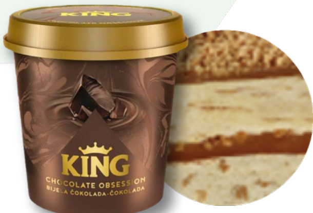
Multi-Layered Technology in Premium Ice Cream