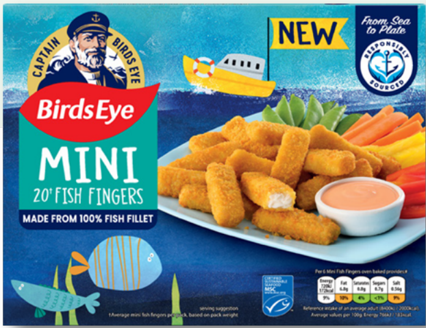
Further Unlocking Happy Family Occasions