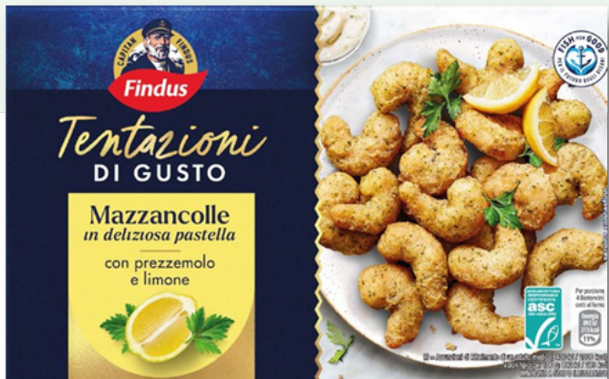
Crispy Seafood Creations